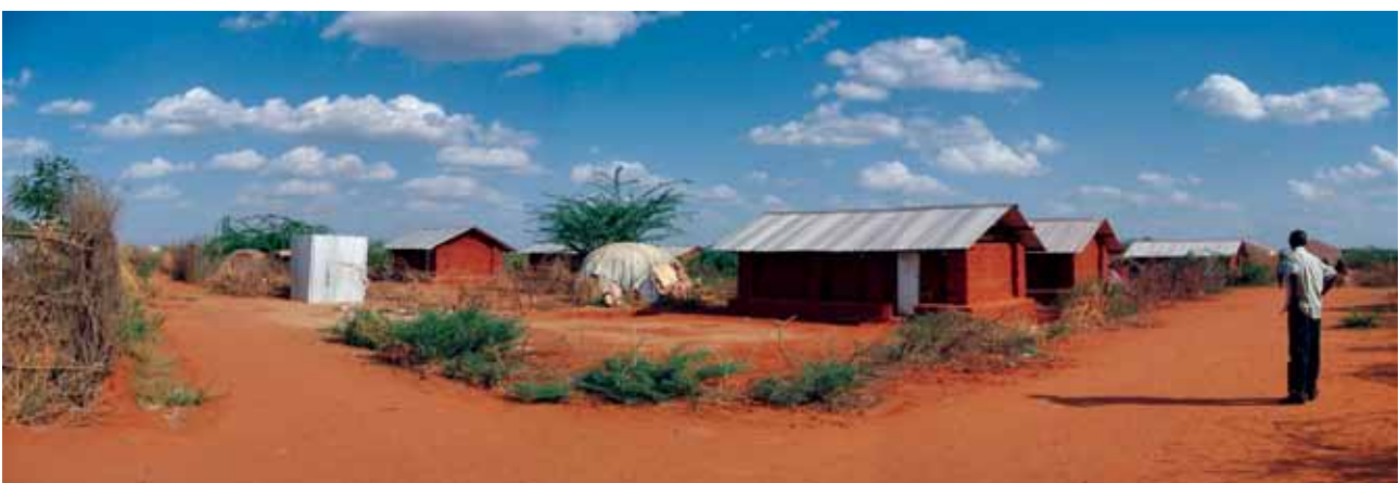
Mud brick houses with a solid plinth to resist future flooding were constructed

A combination of shelter upgrading and emergency response funding assisted 500 families were to make bricks and build shelters. The project was implemented through a community-based construction program following flooding in a large refugee camp.