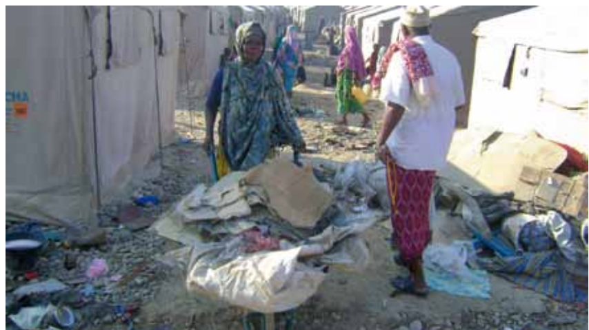
Left: Shelter materials distribution. Right: cleaning up a shelter site