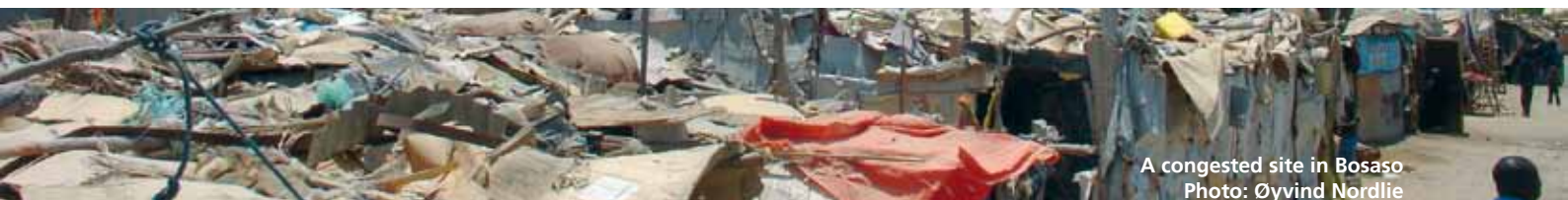
A congested site in Bosaso