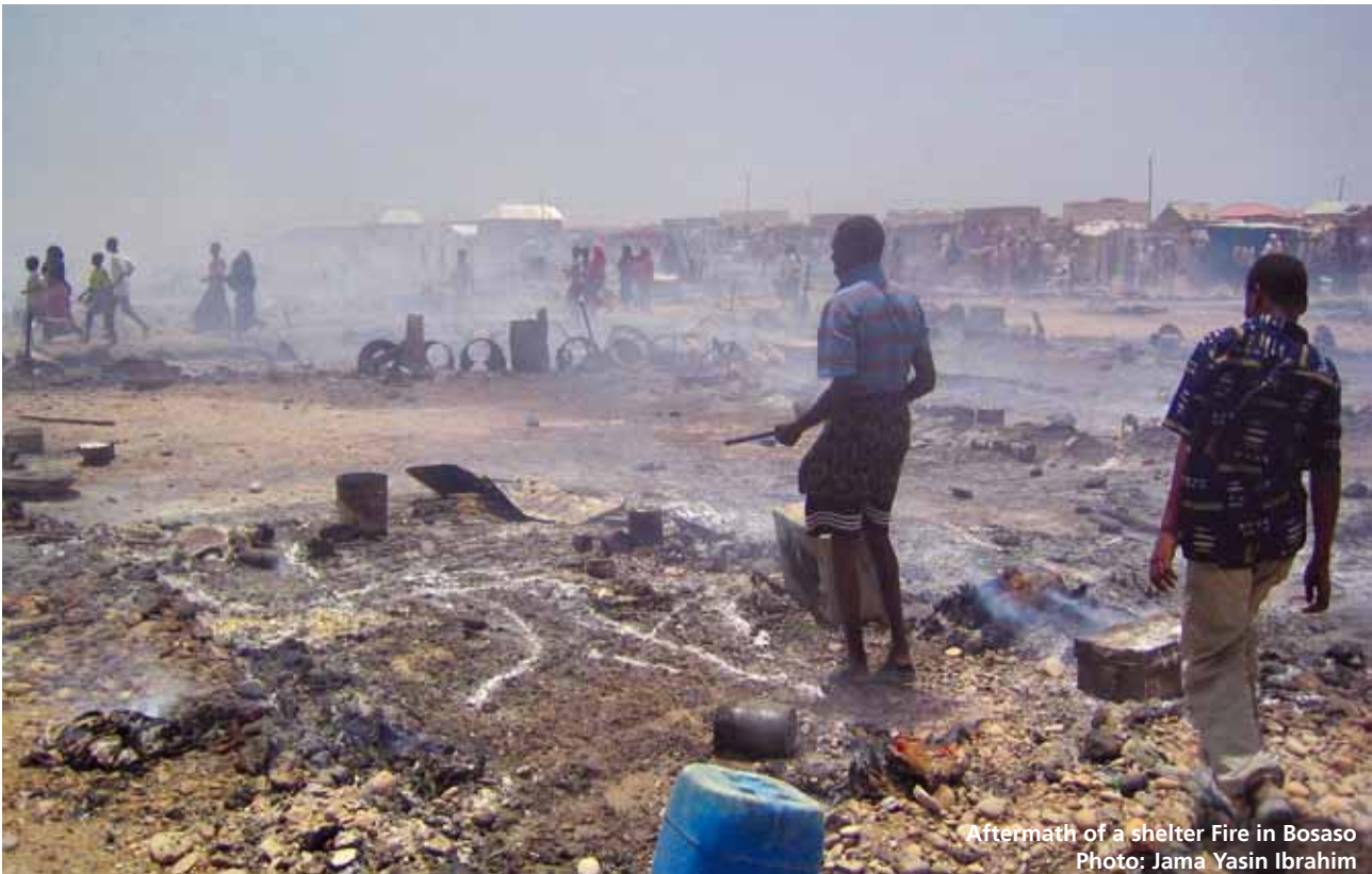
Aftermath of a shelter fire in Bosaso