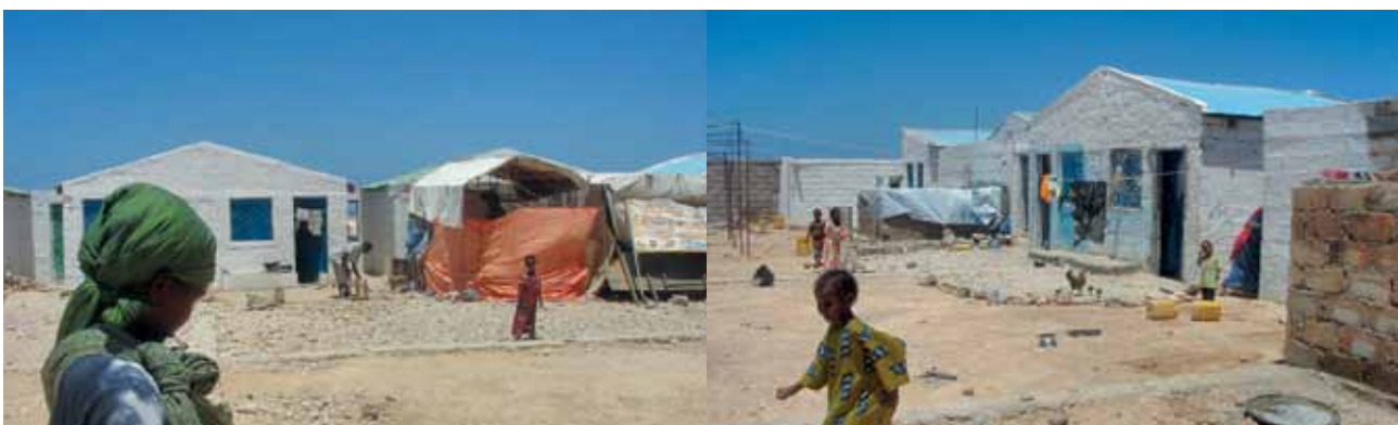
“Sites and services”. The project focused on negotiating land and providing access, secure compound walls, water supply and sanitation for it.

A resettlement project in Puntland, Somalia, preceded by detailed discussions on the concepts of access to land for IDPs and related negotiations on land rights. A consortium of agencies built a serviced community settlement supporting beneficiaries in the construction of extendable single-room houses and providing them with temporary shelters on their new plot.