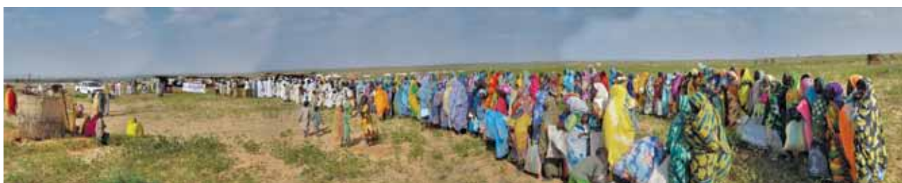
Queue for material distribution.