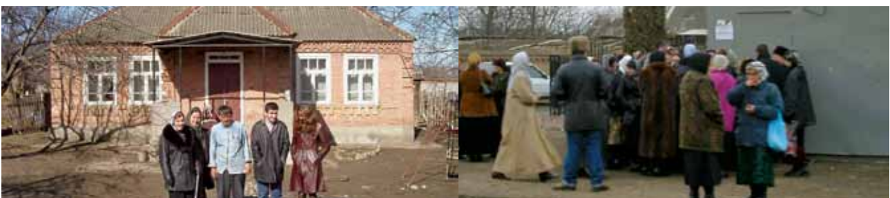
Left: by supporting host families with one off cash grants, the project aimed to avoid evictions

After a successful implementation during winter 2000/01, it was decided to implement a second phase, since the situation for displaced people in Ingushetia had not improved.