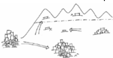
Over the course of several years, people reconstruct their houses and return, although some people remain permanently displaced