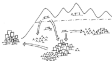
Earthquake strikes. Many people stay, some people move from mountains, to regional cities and to larger cities. Some are forced to live in camps.