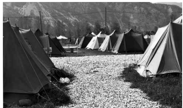
Tents were used until winter, after that hotels, and trains were used. Afterwards prefabricated houses were built.