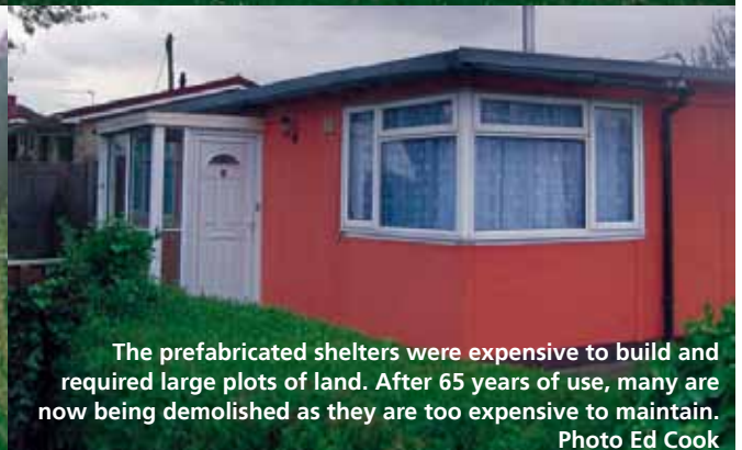
The prefabricated shelters were expensive to build and required large plots of land. After 65 years of use, many are now being demolished as they are too expensive to maintain.