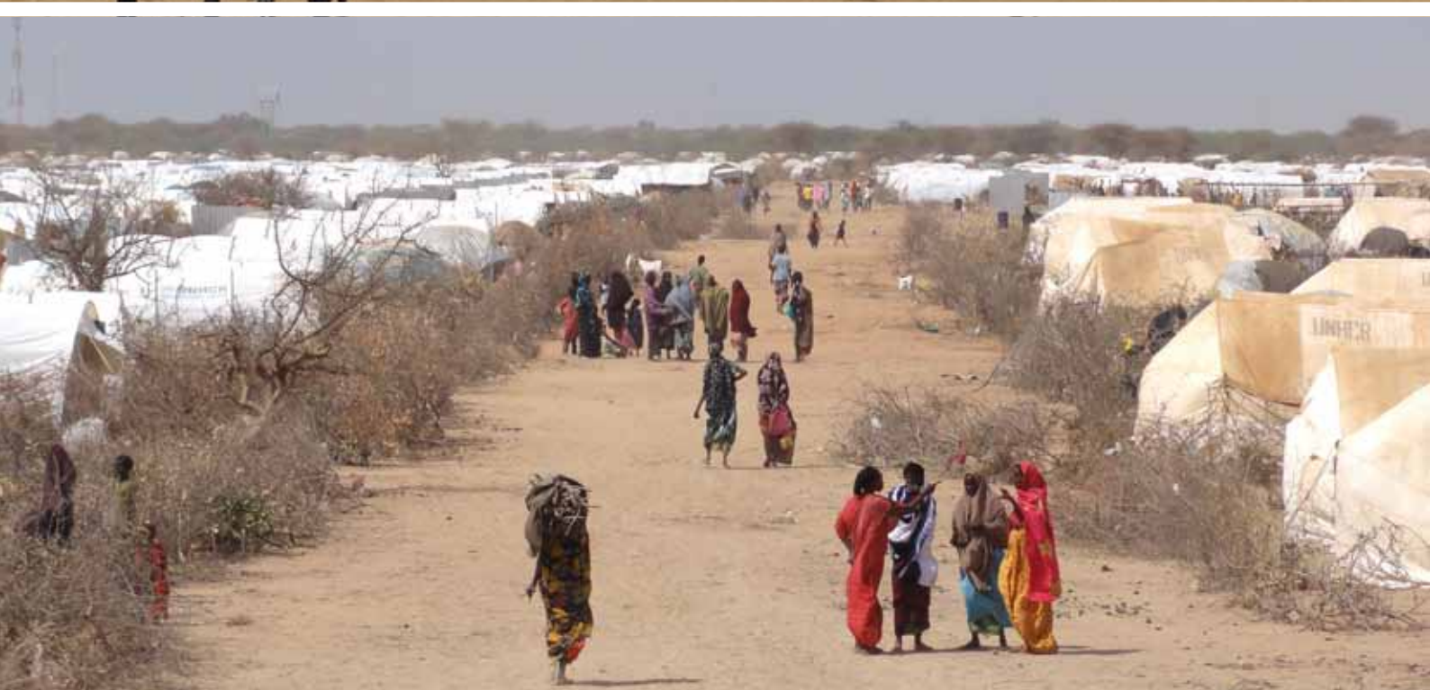
Top to bottom: Site marking; Tent erection on a windy day; Newly established blocks at IFO camp extension. Camps were organised into a) plots, b) communites, c) blocks, and d) sections.