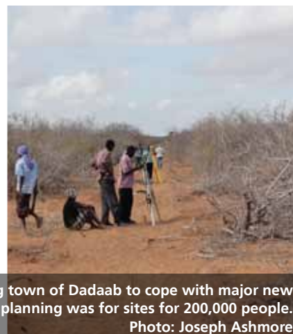
New sites were identified, planned and constructed within 20km of the existing town of Dadaab to cope with major new influxes and a backlog of non-registered new refugee arrivals. Initial planning was for sites for 200,000 people.