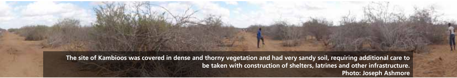
The site of Kambioos was covered in dense and thorny vegetation and had very sandy soil, requiring additional care to be taken with construction of shelters, latrines and other infrastructure.

(six staff were involved). An organisation assigned two engineers in Kambioos and another two in "Ifo 2" to directly monitor the works that were sub contracted to local building contractors.