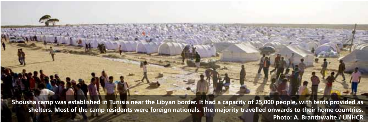
Shousha camp was established in Tunisia near the Libyan border. It had a capacity of 25,000 people, with tents provided as shelters. Most of the camp residents were foreign nationals. The majority travelled onwards to their home countries.