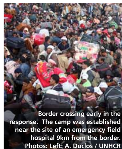
Border crossing early in the response. The camp was established near the site of an emergency field hospital 9km from the border.

By the end of 2012 around 1,200 refugees and asylum seekers remained in the camp. The majority were awaiting resettlement, some within Tunisia. In addition, around 200 rejected asylum seekers remained in the camp. The organisation was in discussion with the Tunisian authorities to find a solution for this group since it was outside of the organisation's mandate to assist them.