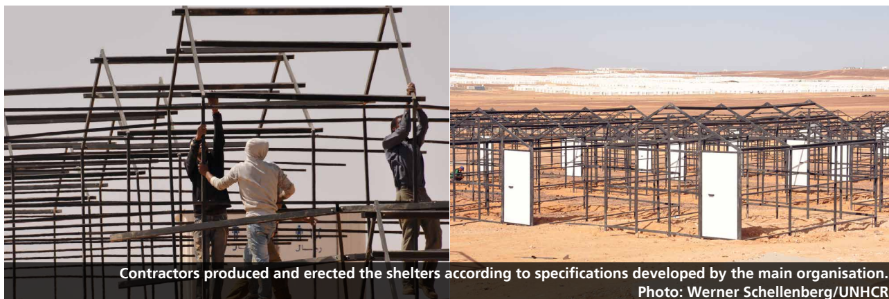
Contractors produced and erected the shelters according to specifications developed by the main organisation.