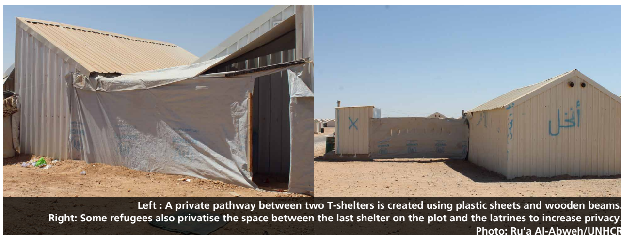
Left : A private pathway between two T-shelters is created using plastic sheets and wooden beams. Right: Some refugees also privatise the space between the last shelter on the plot and the latrines to increase privacy.

rate of construction. There is now local, specialist knowledge in the production, construction and dismantling of the T-shelters.