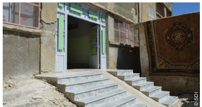
Before (above) and after (right) rehabilitation works in one collective centre.