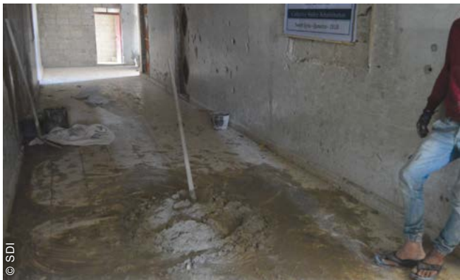
The shelter/protection committees provided valuable feedback which helped agree on priority interventions, such as location of facilities and lighting.

The development of the guidance on collective centre rehabilitation was an important step in harmonizing shelter actors’ approaches in southern Syria. The guidelines were shared at the global level and used to inform programming in other countries in the region.