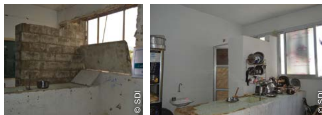
Rehabilitation works included furnishing and upgrade of common kitchens.

In addition to the physical rehabilitation, the project integrated protection considerations into the planning, implementation and management of the collective centres. In accordance to camp management principles, project partners put in place self-managed, community-based, shelter and protection committees (known as Faza'a Committees) 2 in three of the five collective centres. The committees were comprised of five members per location (one manager, two administrators and two protection coordinators) and received training, guidance and coaching from protection teams who operated in mobile units and static centres. The Faza'a committees' primary function was to enhance community-based protection. They were responsible for liaising between residents and humanitarian service providers, ensuring effective information sharing among site residents, supporting the process of establishing communal rules for the collective centre, mediating disputes and ensuring equitable access to communal areas and services for all the residents.