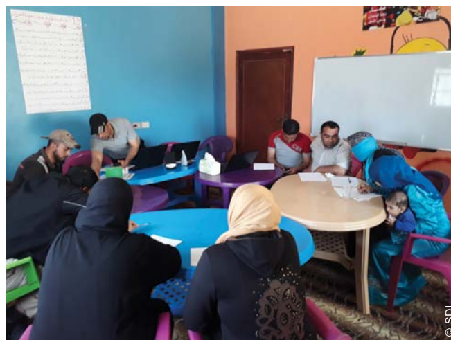
To mainstream protection in the shelter interventions, committees were formed in three collective centres with the role of improving information flows and dispute resolution, as well as fostering participation in the project.