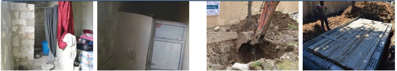
Works included the rehabilitation of water and sanitation facilities (left) and the construction of cesspools and wastewater disposal systems (right).