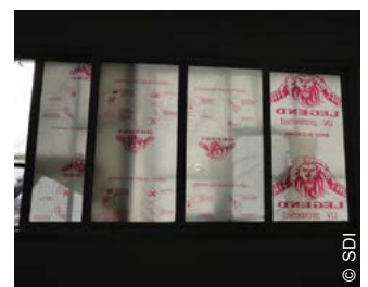
The project applied contextualized standards and procedures developed by the Shelter Sector in southern Syria. However, due to loss of access, it could not be scaled up.