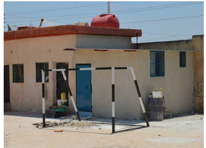
The project was managed remotely and implemented by a local organization selected through a merit-based process.