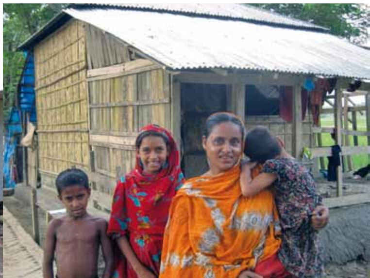
The programme provided support for families to upgrade their shelters. Many families were able to make improvements and extensions from the core house (top left) to the various extended structures (above)