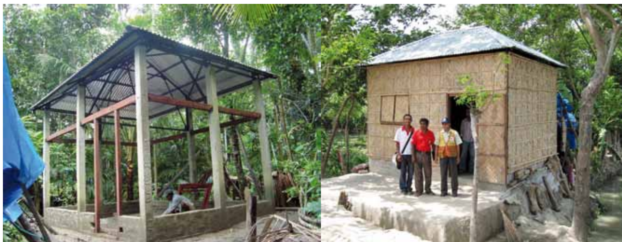
The core shelters were built by contractors and selection of families was through a lengthy transparent process Left shows the frame of the structure