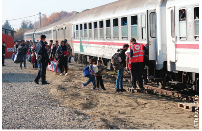
Along the Balkans route, migrants and refugees were assisted with transport to and between transit or registration centres (Croatia, October 2015).

<sup>15</sup> 2017 Regional Refugee and Migrant Response Plan (RRMRP) <sup>16</sup> German Federal Office for Migration and Refugees, <u>http://www.bamf.de/EN</u> <sup>17</sup> This overview focuses on Germany, as it was the main destination country and because the following case study A.42 deals with the set-up and operation of a reception centre near the Austrian border. Other destination countries include Sweden, Austria, the Netherlands and Norway.