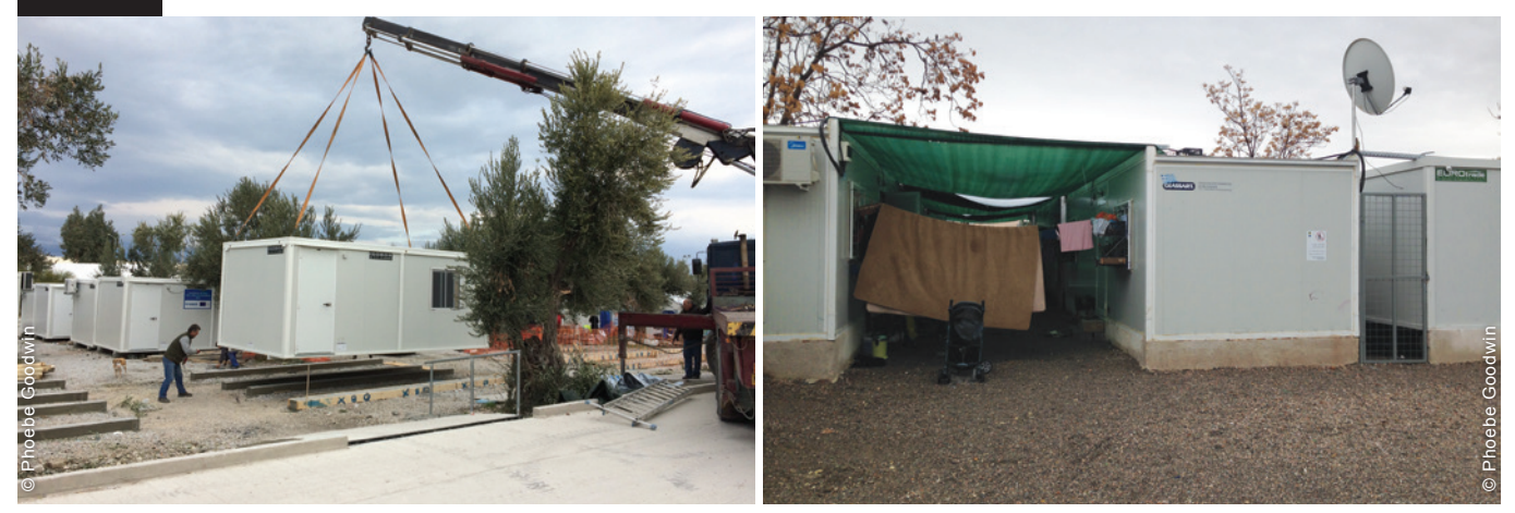
Many refugee camps in Greece were either upgraded from tents or built from the start with containers (Left: Kara Tepe camp, Lesvos. Right: Eleonas, Athens).