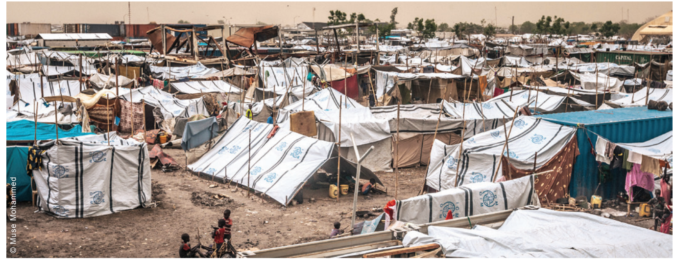
Humanitarian shelter actors are constantly challenged to maximize the available funds, materials and skills. When deciding the appropriate level of support, there needs to be a balance between the impacts on those who will be directly assisted, those who have the capacity to help themselves, and those who will not be reached at all.

Organizations have their own varied capacities, and project design should take into account how to maximize those capacities. For example, one agency may have experience in managing common NFI pipelines, whilst another may specialize in training. There may also be an institutional interest in certain types of projects. For some organizations, there may be an interest in designing the "perfect" response project, while for those working in national coordination or mak-