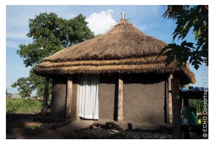
In Palorinya, a partner organization constructed smaller traditional shelters.

By the end of 2016, the Shelter Working Group developed a new eight-year strategy and asked partners to stop upgrading emergency shelters. Instead, the strategy proposed to build larger semi-permanent shelters with local materials, with a lifespan of three to five years, especially targeting vulnerable households arrived between 2016 and early 2017.1