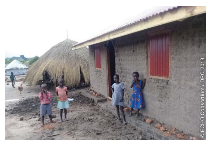
In Rhino the organization built larger, two-room shelters with CGI roofing.