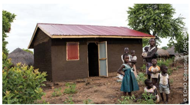
The project provided semi-permanent shelters and latrines to refugees.