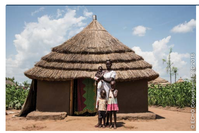
The project involved host community households via cash for work, which helped foster integration and allowed refugees to access more land for livelihoods.