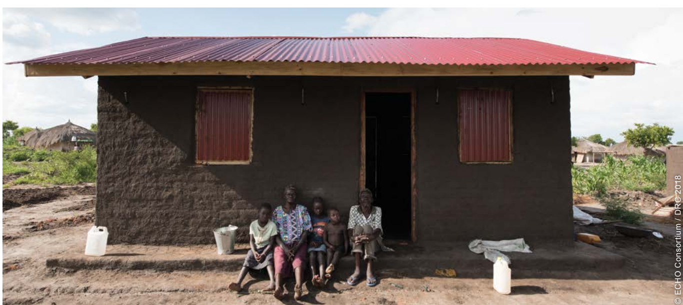
Shelters were built with locally available materials through the engagement of local youth groups who were divided in different teams based on their skills.

To encourage participation in the project, activities were scheduled at appropriate times, women were actively sought out and minimum quotas of women were respected in the construction groups.