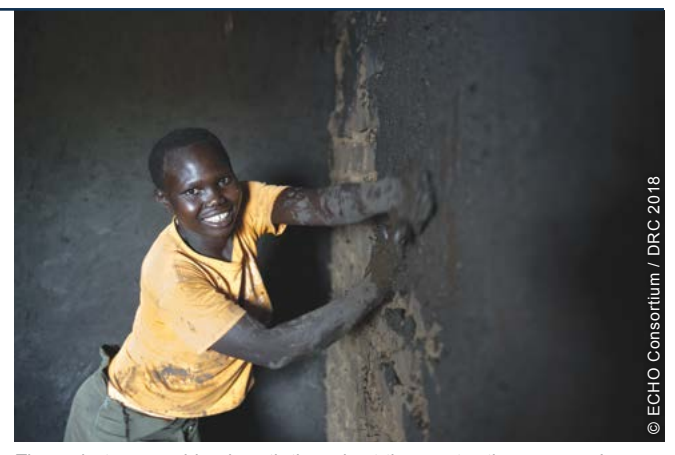
The project engaged local youth throughout the construction process. In some cases, the rendering phase presented some challenges for the beneficiaries.