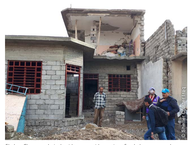
Shelter Cluster technical guidance provides options for shelter support that can be customized to the specific needs of families.