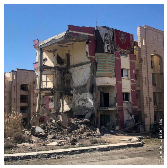
The Shelter Cluster is coordinating with stabilization and development actors on housing rehabilitation/reconstruction, with development actors focusing primarily on urban centers.

So far, the Shelter Cluster has collected a record of more than 71,000 houses collectively being repaired, of which 52% are the ones rehabilitated by the Fast Funding for Stabilization program. To ensure continuity of technical standards and building upon existing experience and capacity, in 2021 the Shelter Cluster is co-chairing a Shelter /HLP sub-group under the newly established Durable Solutions Framework in Iraq, to collect and update guidance through a durable solutions lenses, bringing together humanitarian and development actors.