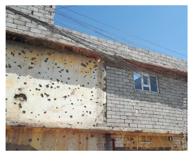
Since the end of the conflict, damage and destruction of housing is one of the key barriers to displaced people being able to return.