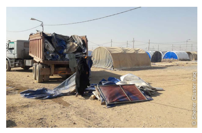
In formal camps targeted repair and replacement of tents is carried out.

The Shelter Cluster has also proposed to the Government to upgrade some camps with locally constructed temporary shelter using traditional construction techniques (earth blocks). Negotiations are ongoing to resolve potential Housing Land and Property issues on land ownership and host community acceptance to such settlement integration. Advocacy on this approach will be channeled through the Durable Solutions Framework, with support from the Shelter Cluster.