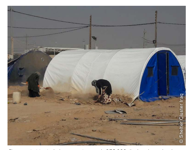
Cluster priorities include supporting nearly 275,000 displaced people who are living in formal camps.

These efforts are also combined with advocacy towards relevant authorities and development actors to encourage more wide-scale housing reconstruction and rehabilitation programs, in conjunction with stronger governmental financial support through compensation schemes.