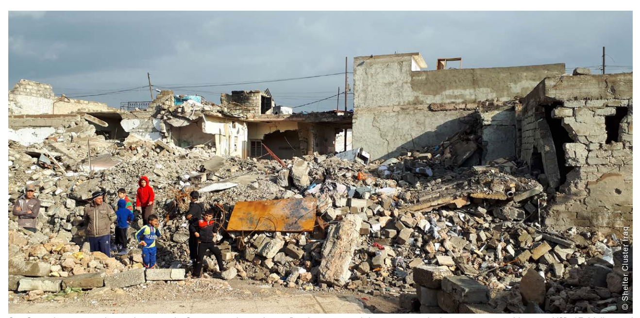
Significant damage was done to homes and infrastructure during the conflict. It is estimated that to recover the housing sector would require USD 17.4 billion and decades of construction programs.

The Humanitarian Country Team (HCT) identified the Protection of Civilians, support for IDPs, Food Security, Essential Services, and Conflict-Sensitive Programming as the highest priorities for the humanitarian response. In 2018 the World Bank estimated the overall reconstruction and recovery needs at USD 88.2 billion, with USD 22.9 billion needed for the short term, and USD 65.4 billion needed for the medium term. The housing sector, which experienced the highest damage level, would require USD 17.4 billion and decades of reconstruction programs – clearly beyond the capacity, resources and mandate of both humanitarian and development partners.