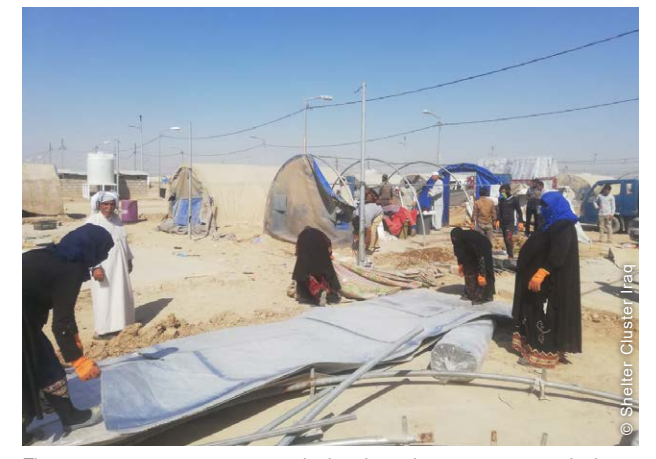
The response continues to support displaced populations in camps and other settings, while also supporting people to be able to return to their homes.

2021: Shelter Cluster collaboration on Durable Solutions Framework.